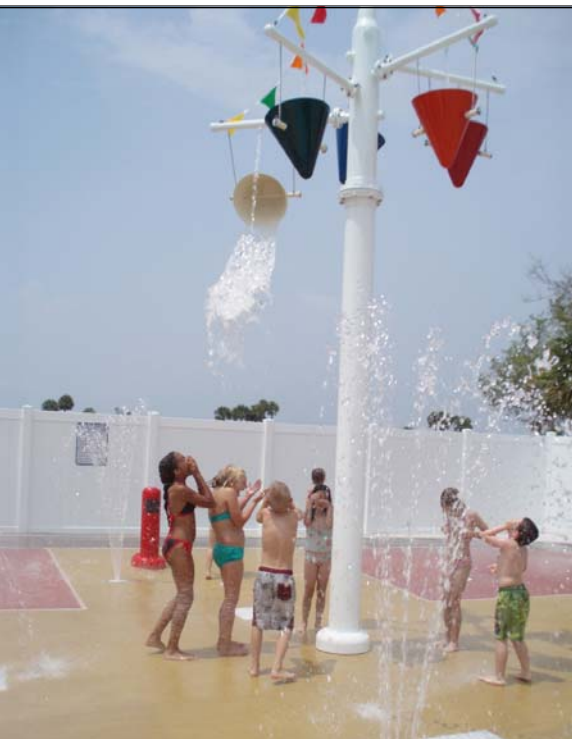
Kids Gather at Base of the Bucket Dumper in Anticipation of Getting Splashed