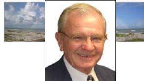
"STATE OF THE CITY" 2011